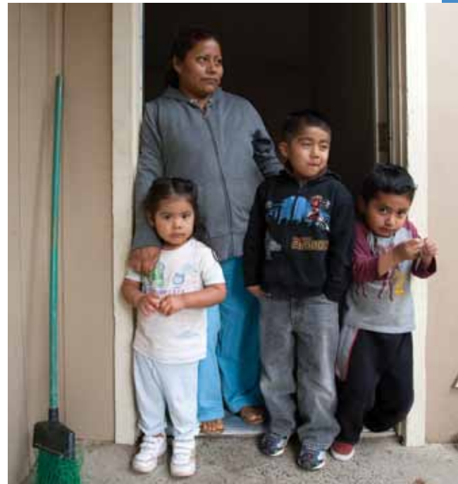
Many women stay in the U.S. for their children.

The accurate collection of data depicting migrants’ deaths is also challenging because of the number of agencies involved and the differing reporting standards. The U.S. Border Patrol does not include data from the Mexican side of the border, which almost certainly