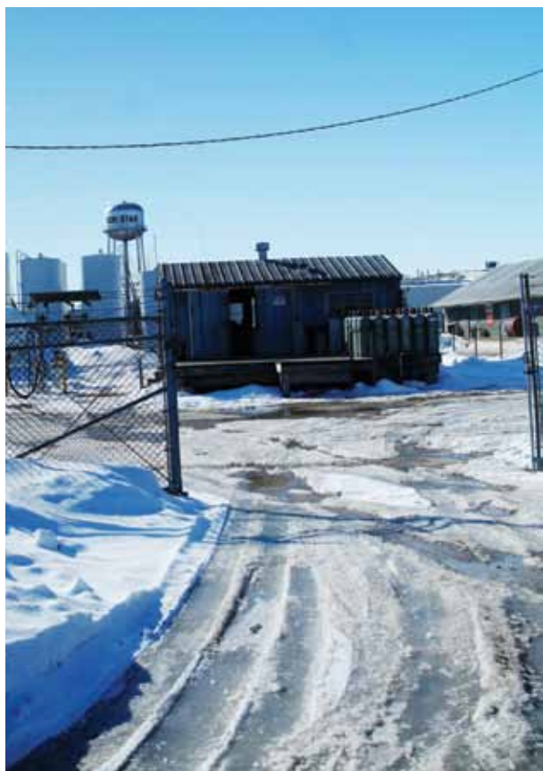
The Agriprocessors Inc. plant in Postville, Iowa, was the scene of horrendous workplace abuses.