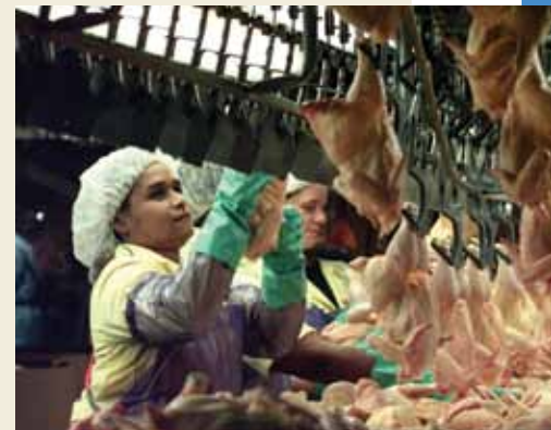
Poultry processing is one of the most dangerous occupations in America, killing 100 workers and injuring 300,000 each year.

“You suffer to come. Then once you’re here, you suffer some more.”